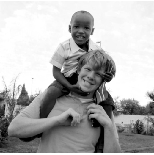
Cape Town, South Africa