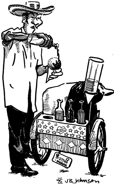
Christmas card illustration from our assignment to Panama (1994-97).