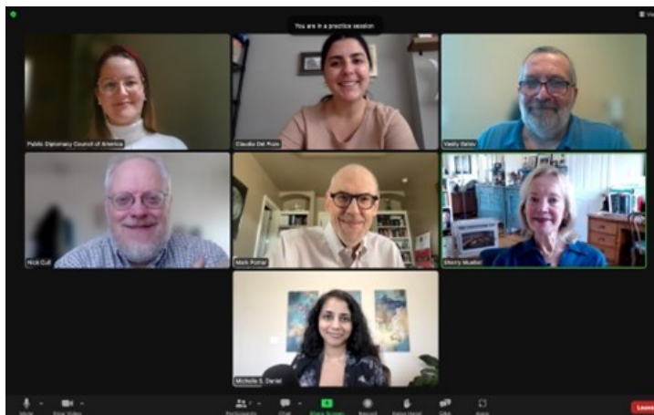
December 7 First Monday Forum Hosts and Panelists at Zoom program co-sponsored by partner USC Annenberg Center on Communication Leadership and Policy, a PDCA partner.